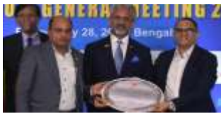
Infrastructure, Energy, IT & Cybersecurity Expert Environment and Water Expert Committee 2022-2023