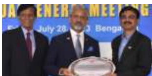
e-Commerce, Retail, Logistics & Warehouse Expert Committee 2022-2023