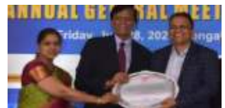
Ease of Doing Business Council (S2S) Expert Committee 2022-2023