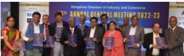
BCIC Released its 46th Annual Report 2022 - 2023