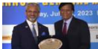
Deloitte Touche Tohmatsu India LLP