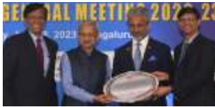
Human Resources & Women Leadership Expert Committee 2022-2023